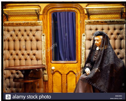
England’s Queen Victoria in her Royal Train Coach